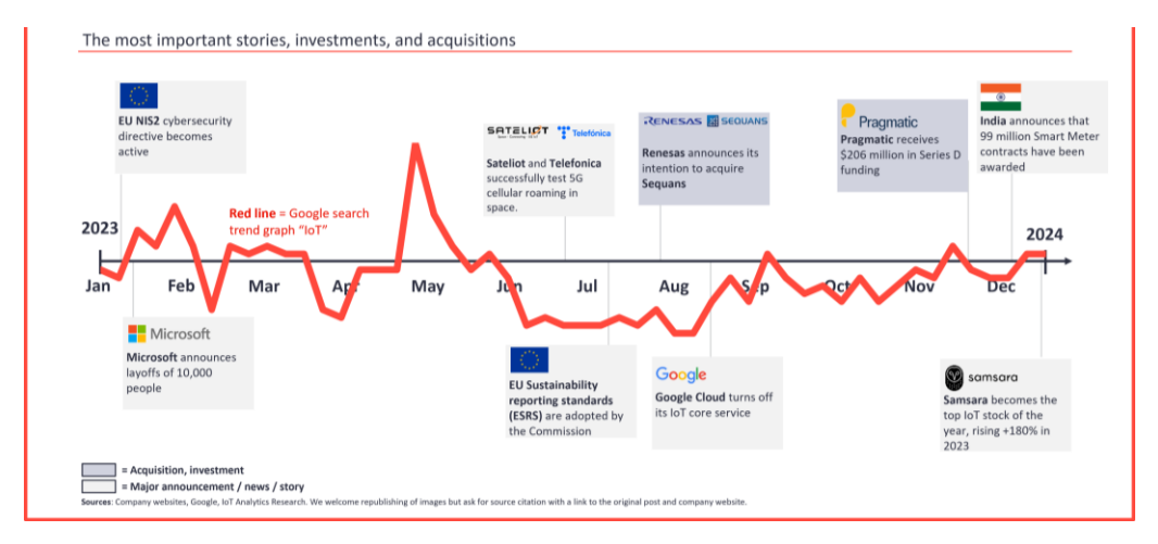
Fig. 2. The IoT year 2023 in review.