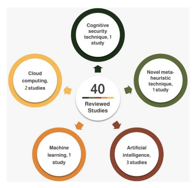
Fig. 1. Cybersecurity detection techniques.

Given the critical nature of IoT applications in healthcare, transportation, and finance sectors, addressing these cybersecurity challenges is paramount. This paper explores the multifaceted cybersecurity issues inherent in IoT cloud systems, including device vulnerabilities, data integrity, privacy concerns, and network security. Additionally, it will delve into emerging technologies, such as AI, blockchain, and fog computing, as potential solutions to bolster security in these environments. AI-driven systems can analyze patterns in network traffic to identify anomalies, while blockchain technology can offer decentralized, tamper-proof mechanisms for authentication and data integrity. Fog computing provides an alternative architecture that reduces reliance on centralized cloud systems, allowing for localized processing and enhanced security.